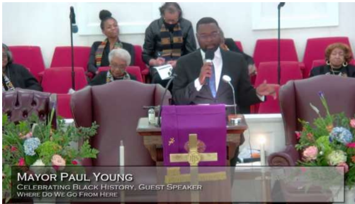
Mt. Pisgah CME, February 18, 2024 (click image to load video)

I believe that seeing this kind of work, combined with other efforts from our administration, will be inspiring to the young people in our community. It will be uplifting the people who have made these communities home for their entire lives. It is the time to speak life into our city. I am ready to lead these efforts and our team is ready to do the work.